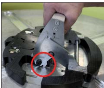
Safety coil center 90915-S: Releasing the hooks from the plate