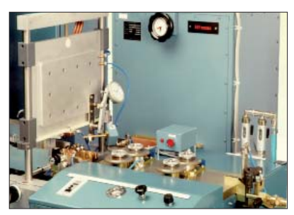
Tooth hardening generator