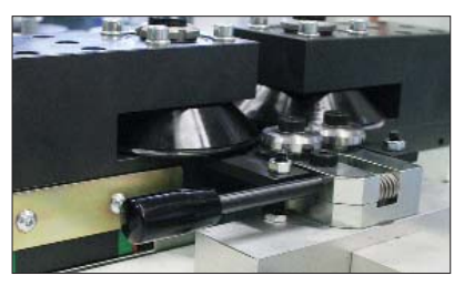
Pinch roller straightening unit