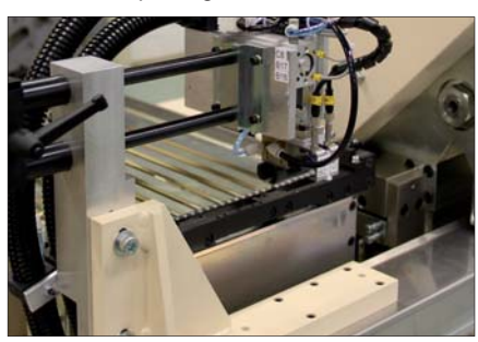
Outfeed magazine with pick and place unit