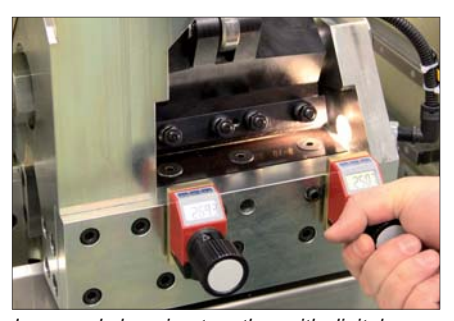
Improved clamping together with digital micrometer makes clamping adjustments easier