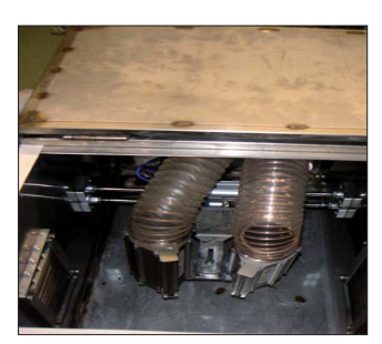
High pressure air knives