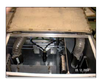
High pressure spray cleaning