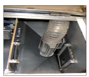
Oil blow off with air knives